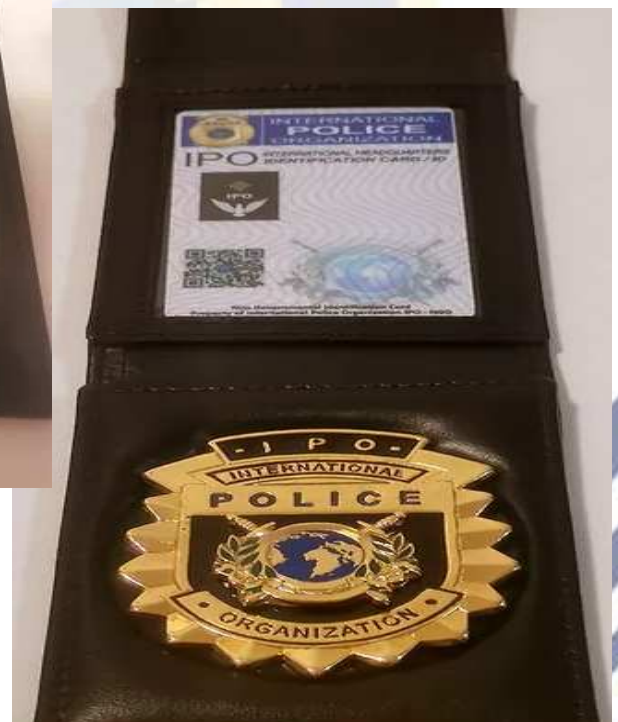
New Section Leader Badge Since 01.08.2020

Source: https://www.interpolice.org/join-us