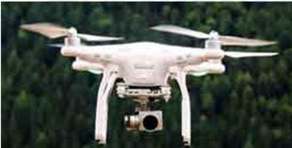
Drone law in the UK

Lancashire Police are compliant with the new GDPR legislation.