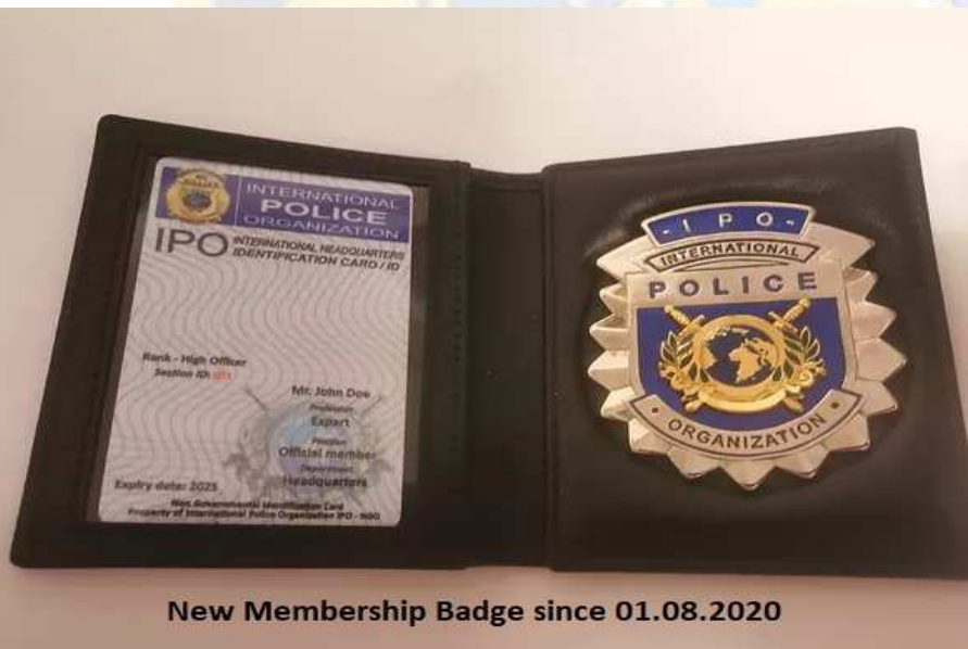
New Membership Badge since 01.08.2020